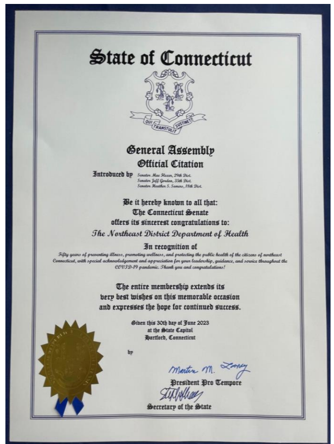
CT General Assembly Official Citation congratulating NDDH on 50 years of service.